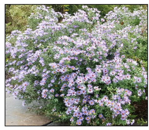
Blue wood aster (Symphyotrichum cordifolium)