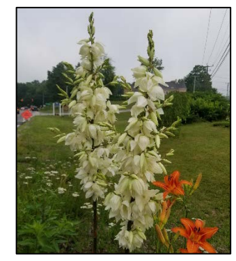
Adam's Needle (Yucca filamentosa) flower