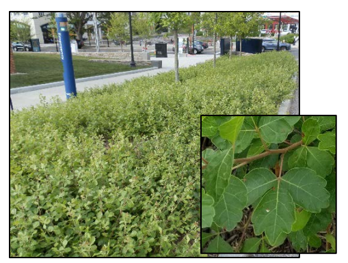
Fragrant sumac (Rhus aromatica 'Gro-Low')

Northern bush honeysuckle (Diervilla lonicera)