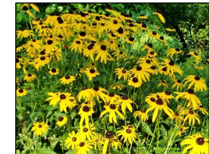
Black-eyed Susan (Rudbeckia hirta)