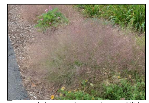
Purple lovegrass (Eragrostis spectabilis)